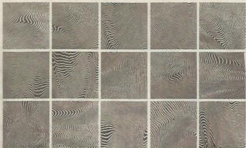
(Above, right and below) Some of the exhibits that are being showcased